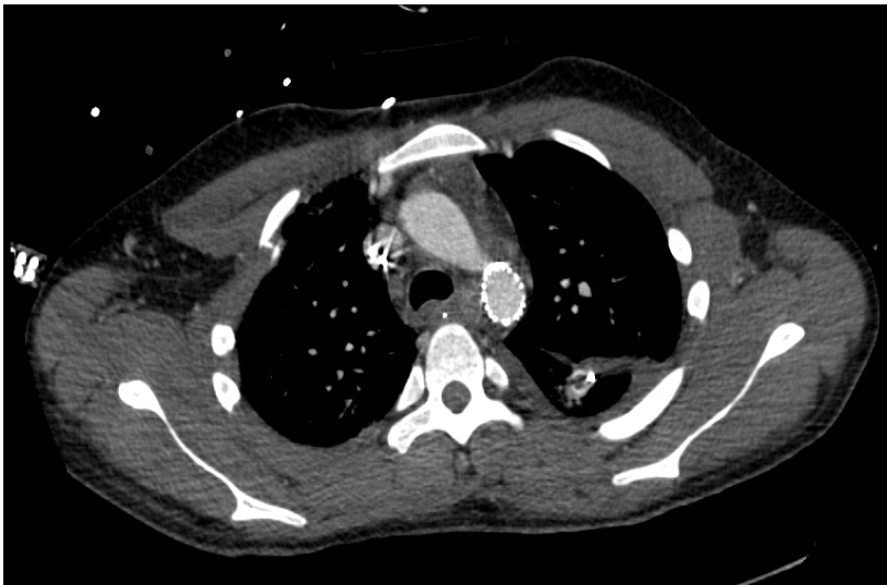
Image 2: Successfully performed minimally invasive stenting of the lesion above